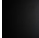
OP17 matt black