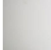
OP71 matt white