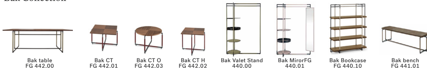
Bak table FG 442.00