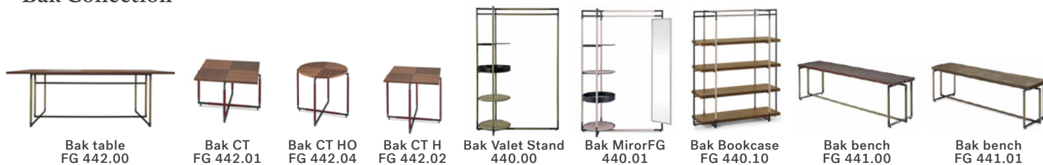
Bak table FG 442.00