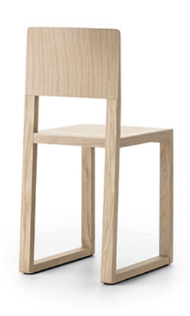
360° | Gallery