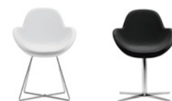
Darling FG 356.00