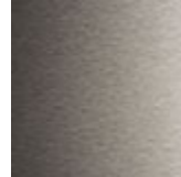
satine stainless steel