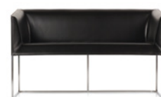
Gavi TS FG 343.01