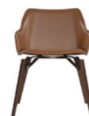
Iki PW FG 333.06