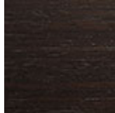
frRB burned oak stained ashwood