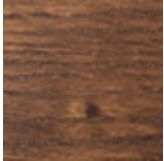
frNC Canaletto walnut stained ashwood