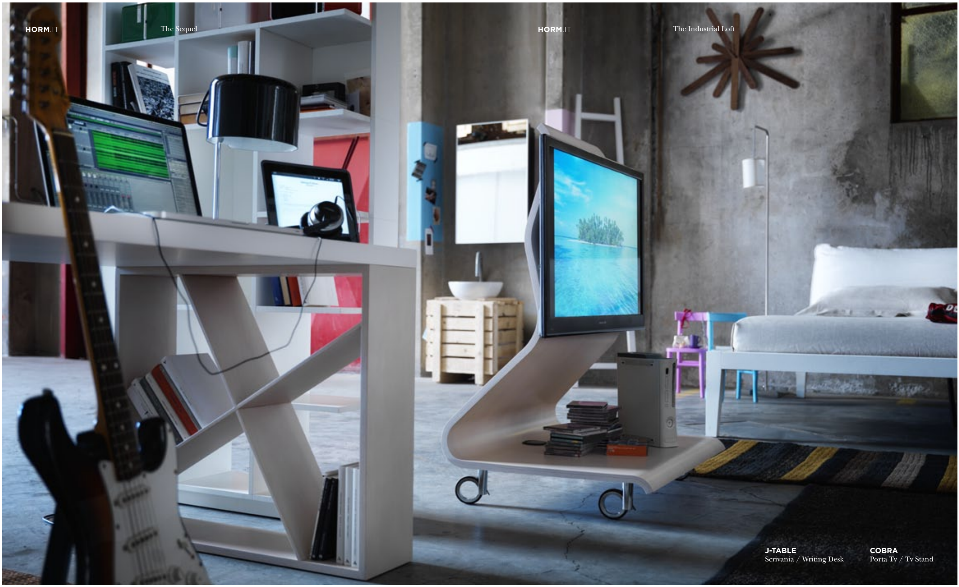
J-TABLE Scrivania / Writing Desk