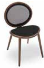
004.25 seat in upholstered / back mesh