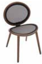
004.11 seat and back mesh