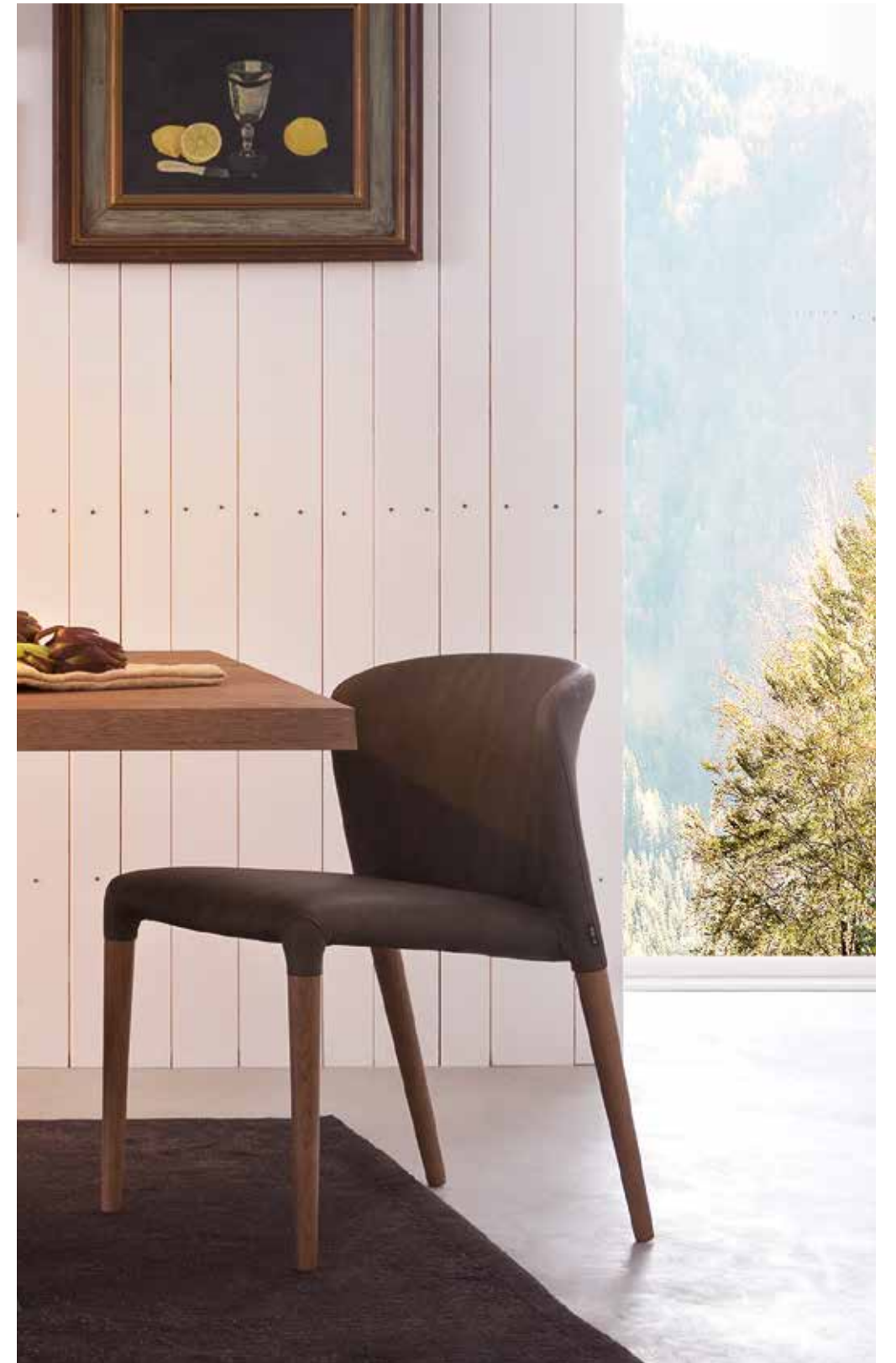
BOARD tavolo / table Struttura verniciato Ghisa, piano Rovere antico Biscotto / Structure in Ghisa painted, top in Antique walnut Biscotto L240 P100 H75 KAROL WOOD sedia / chair Ecopelle Alce 240 , gambe Fashion wood Rovere Biscotto / Alce 240 ecoleather, legs in Biscotto oak Fashion wood L50 P62 H80 RECTA credenza / sideboard Laccato Ghisa opaco, Rovere antico Biscotto / Matt Ghisa lacquered, Antique walnut Biscotto Fashion wood L246,8 P55 H78,2