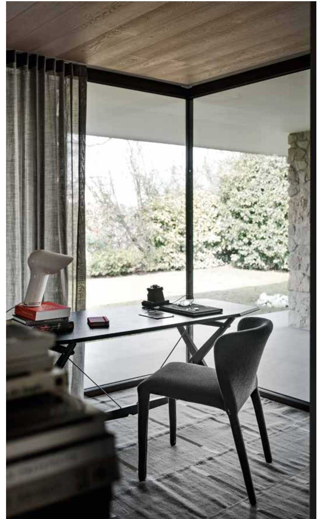
KAROL sedia / chair Tessuto St. Moritz 162 / St. Moritz 162 fabric L50 P62 H80