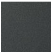
GF69 embossed graphite