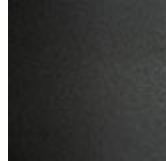
GFM69 graphite embossed