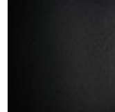
GFM73 black embossed