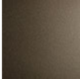
GFM11 titanium embossed