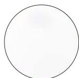
T02 RAL 9016 White