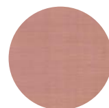
T64 Brush Matt Copper