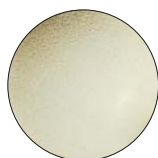
T25 Matt Champagne Gold