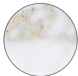
T31 Shiny White Calacatta