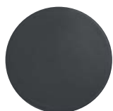
T03 RAL 7016 Grey