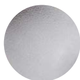
T24 Satin Chrome