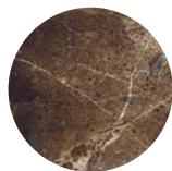
T33 Matt Black Travertine