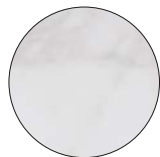
T30 Matt White Carrara