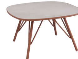
#624 Side Table