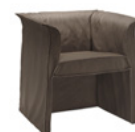
Parentesi FG 422.00