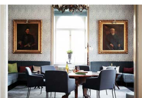
J-Hotel The Club House (Stockholm, Sweden)