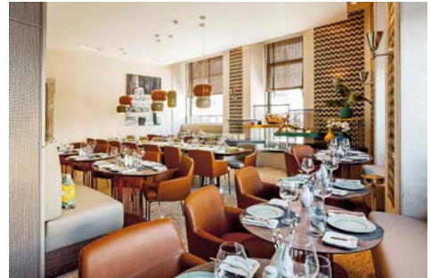
Bairro Alto Hotel (Lisbon, Portugal)