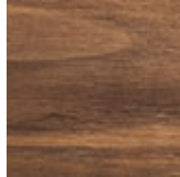
NC walnut canaletto