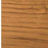
HR Heritage oak