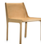
Nisida FG 342.00