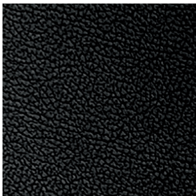
nero F04 black F04