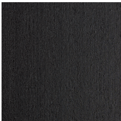
Nero poro aperto Open pore black finish