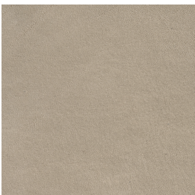
Perla 2118 Pearl grey 2118