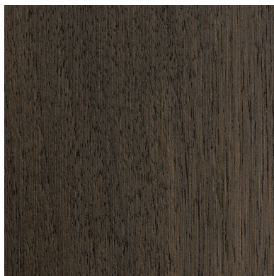
Tabacco Tobacco finish