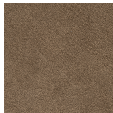
Castagna 2116 Chestnut brown 2116