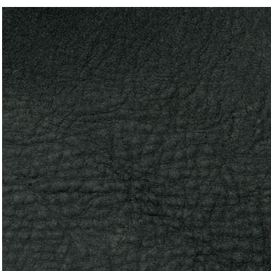
Lavagna 2138 Slate black 2138