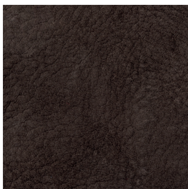
testa di moro 2114 dark brown 2114