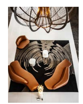
Epic Sana Hotel (Lisbon, Portugal)