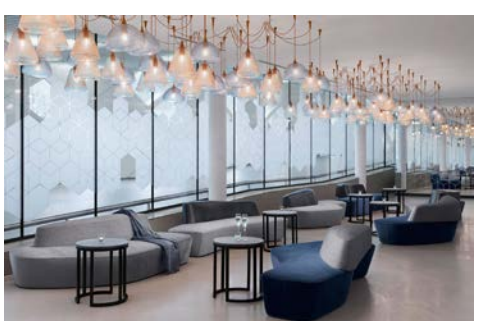
Schiphol Real Estate (Amsterdam, The Netherlands)