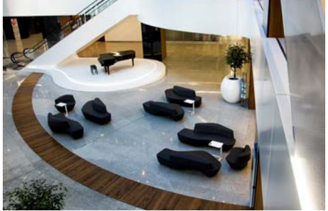
Warsaw Trade Tower (Warsaw, Poland)