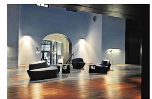
Alma Hotel (Barcelona, Spain)