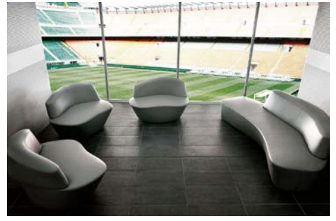
Stadium Meazza S. Siro (Milan, Italy)