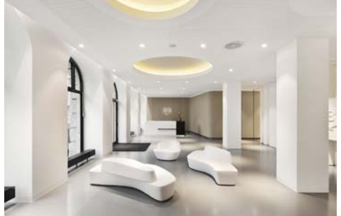
EB Group (Berlin, Germany)