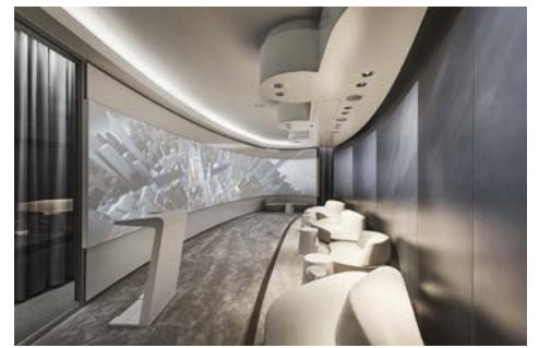
Microsoft (Berlin, Germany)