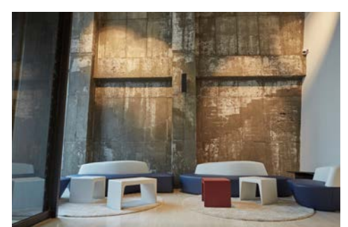
Cocomo Hotel (Seoul, South Korea)