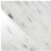
BC polished white Carrara