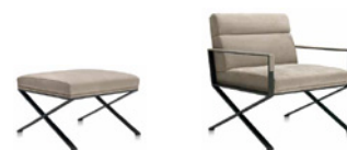
Sahrai Pouf FG 471.01