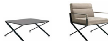
Sahrai CT FG 471.02