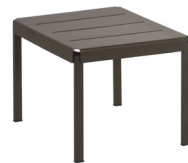
#250 Side Table / Footrest 8.5 lbs D 17.5" / W 23.5" / H 15.5"