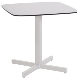
#256 HPL Top Table 30 lbs D 31" / W 31" / H 29" HPL Colors: White 23, Brown 41, Taupe 71