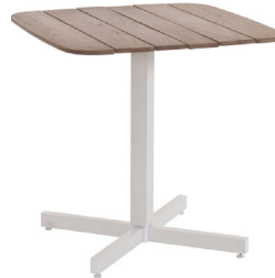
#257 Teak Top Table 19.5 lbs D 31" / W 31" / H 29"