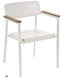
#248 Armchair 4 12.5 lbs D 22.5" / W 23.5" / H 30.5"