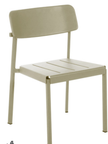
#247 Side Chair 4 10.5 lbs D 21.5" / W 19.5" / H 30.5"