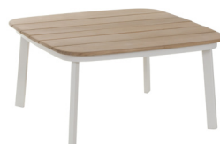
#252 Teak Top Low Table 18 lbs D 31" / W 31" / H 16"