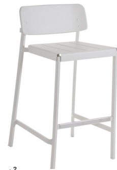
#253 Barstool 2 12 lbs D 22.5" / W 21.5" / H 38"