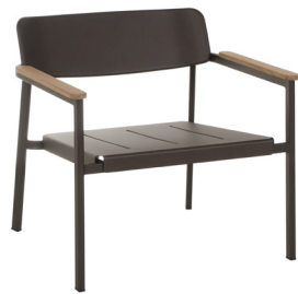
#249 Lounge 2 15.5 lbs D 25.5" / W 30.5" / H 28.5"