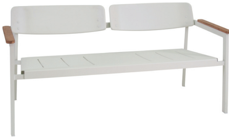
#260 Loveseat 4 41 lbs D 25.5" / W 58" / H 28"