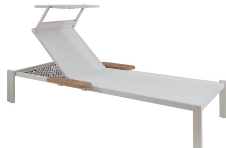
#295 Chaise 2 50.5 lbs D 82.5" / W 30.5" / H 14"-38" Sunshade, Armrest, and Storage Net sold separately