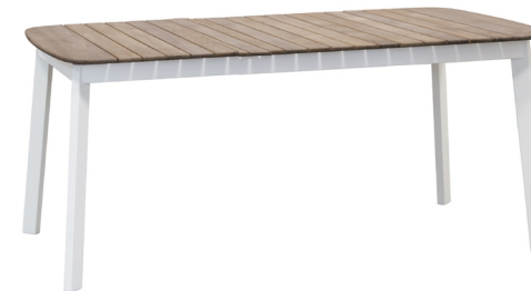
#298 HPL Top Rectangular Table 51 lbs D 40" / W 66" / H 29.5" HPL Colors: White 23 #299 Teak Top Rectangular Table