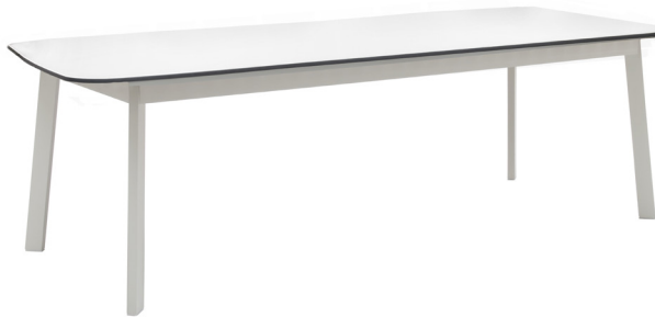
#299 Teak Top Rectangular Table 83 lbs D 40" / W 84" / H 29.5" HPL Colors: White 23 #259 HPL Top Rectangular Table #251 Teak Top Rectangular Table