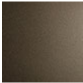
GFM11 titanium embossed