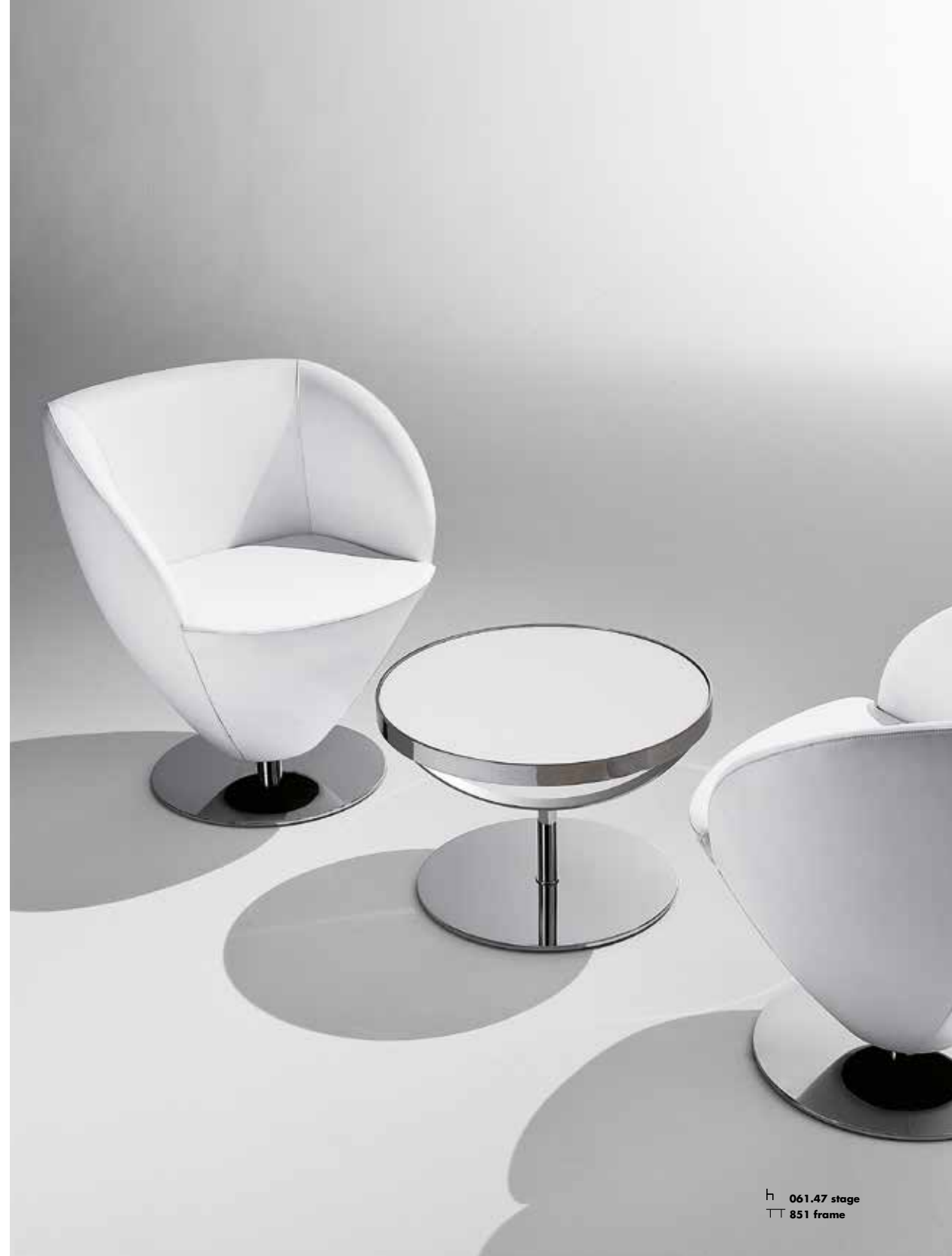
h 061.47 stage TT 851 frame