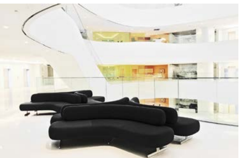
CJ Corporation, CJ Blossom Park (Seoul, South Korea)