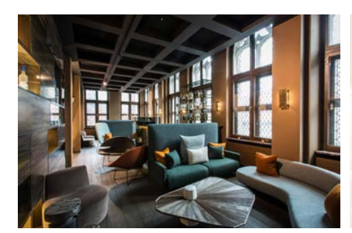
The Fourth, Tafelrond Hotel (Leuven, Belgium)