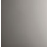
polished stainless steel